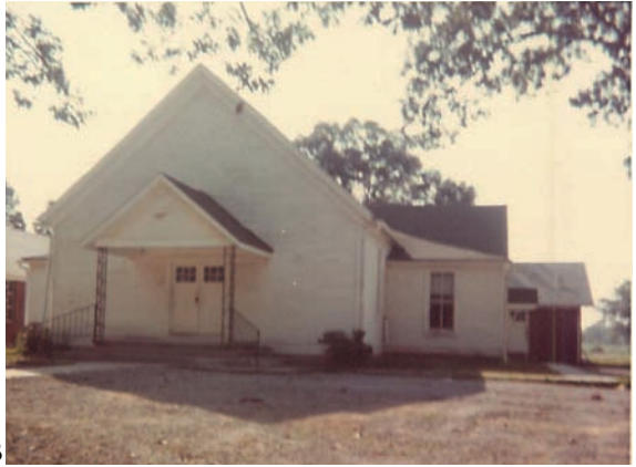
1904 building, Aug. 1973