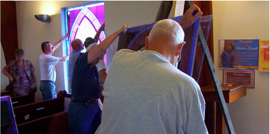
New stained glass windows were installed in 2004.