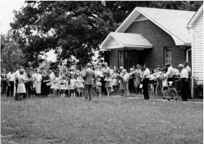
1972 groundbreaking service.