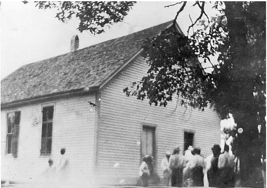
Oak Grove Baptist Church photo dated Aug. 11, 1919.