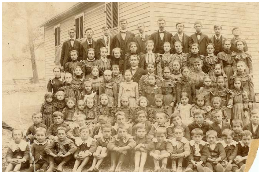
Oak Grove School, ca. 1892.