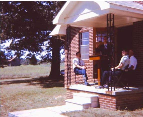
Education Building, 1970 Homecoming, photos provided by Janie Sumner