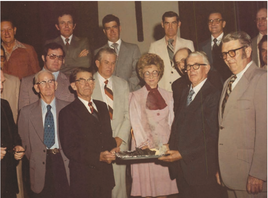
Note burning ceremony, Oct. 29, 1978.