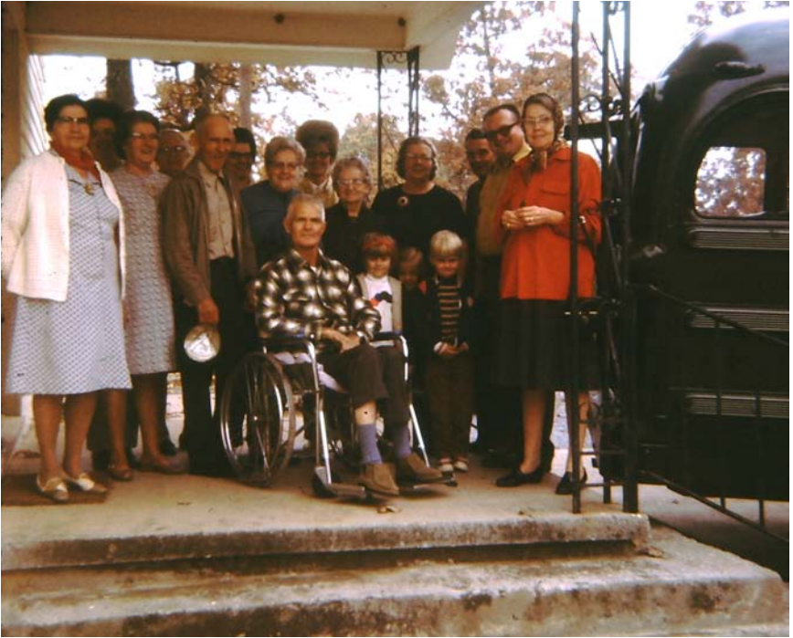
Senior citizen outing, fall 1972.