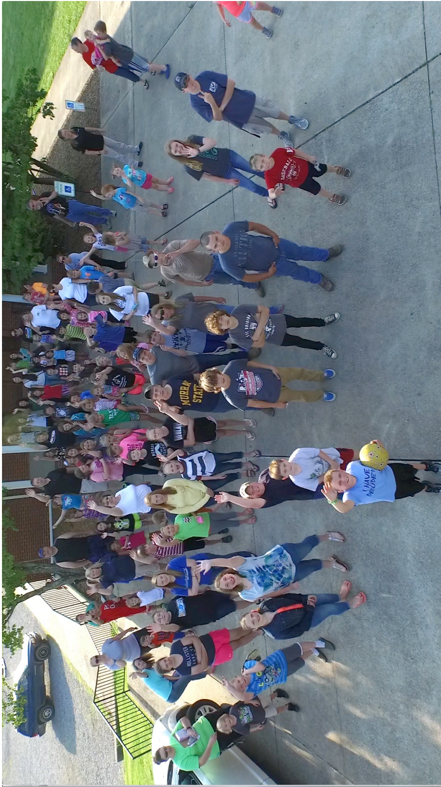
Vacation Bible School 2015. Photo provided by Steve Johnson. Visit oakgrovebaptist.church to see more church event photos.