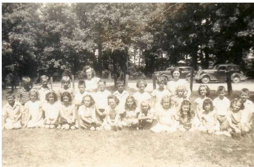
Vacation Bible School, intermediates class, 1946.