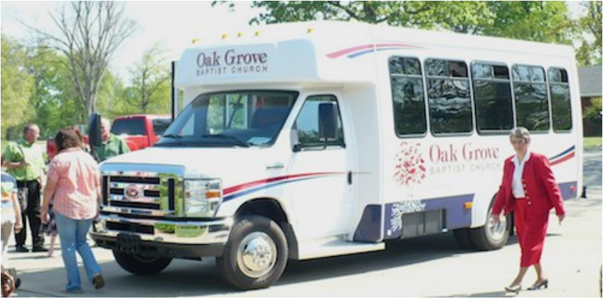
Members inspect Oak Grove's new bus in April 2012.