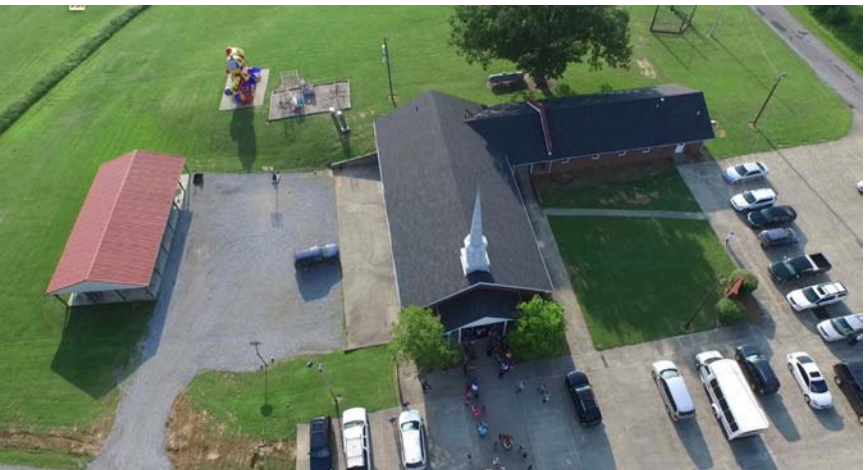
Drone view of church grounds during VBS 2015.