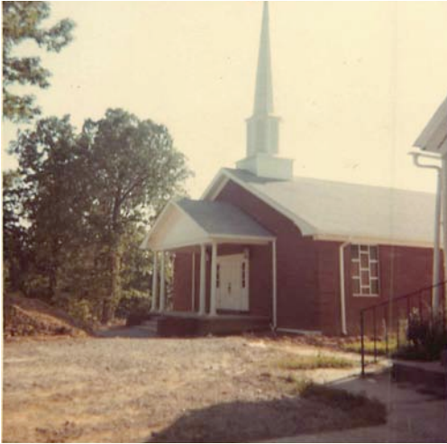
Current building, Aug. 1973